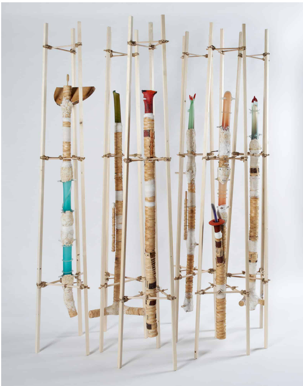
Adriana Popescu, Altoi (Graftage) , 2000, mixed media dimensions variable. Photos: Marius Poput. Installation view fair: Andrea Rossetti. Courtesy the artist and Plan B Cluj, Berlin

Adriana Popescu → (1954–2007) was a Romanian artist known for her innovative glass art, creating surreal, phantasmic forms that transport viewers into an imaginative, mystical universe. Born in Craiova and later based in Cluj, she studied drawing, sculpture, and painting but ultimately chose glass as her primary medium. Popescu's work blends light, transparency, and texture, evoking dreamlike worlds inhabited by underwater creatures, prehistoric flora, and fantastical objects. Her art merges materials such as glass, wood, and metal into delicate, alchemical installations, with pieces like Altoi (2000) exploring themes of fusion and transformation. Her installations, often adaptable in size, emphasize organic growth and evolving nature, and her creative process embraced the battle with materials to convey ideas beyond words. Popescu's work continues to captivate audiences with its otherworldly beauty and conceptual depth.